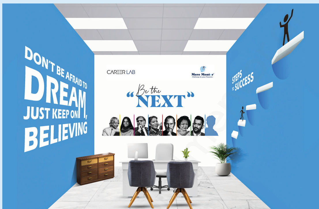
( CAREER LAB INFRA )

Career Lab is an in-school, experiential, and research-driven career discovery initiative by Beyond Mentor, aimed at helping students from Grade 8 to 12 build career awareness, self-understanding, and decision-making skills.